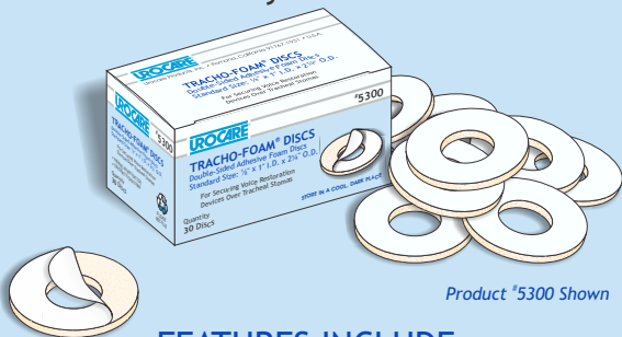
Product #5300 Shown

For Securing Valve Housings of Voice Restoration Systems to the Neck