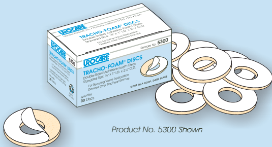
Product No. 5300 Shown

For Securing Valve Housings of Voice Restoration Systems to the Neck